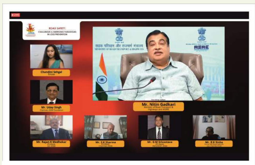
Mr. Nitin Gadkari, hon'ble minister, Addressing the participants at inaugural function