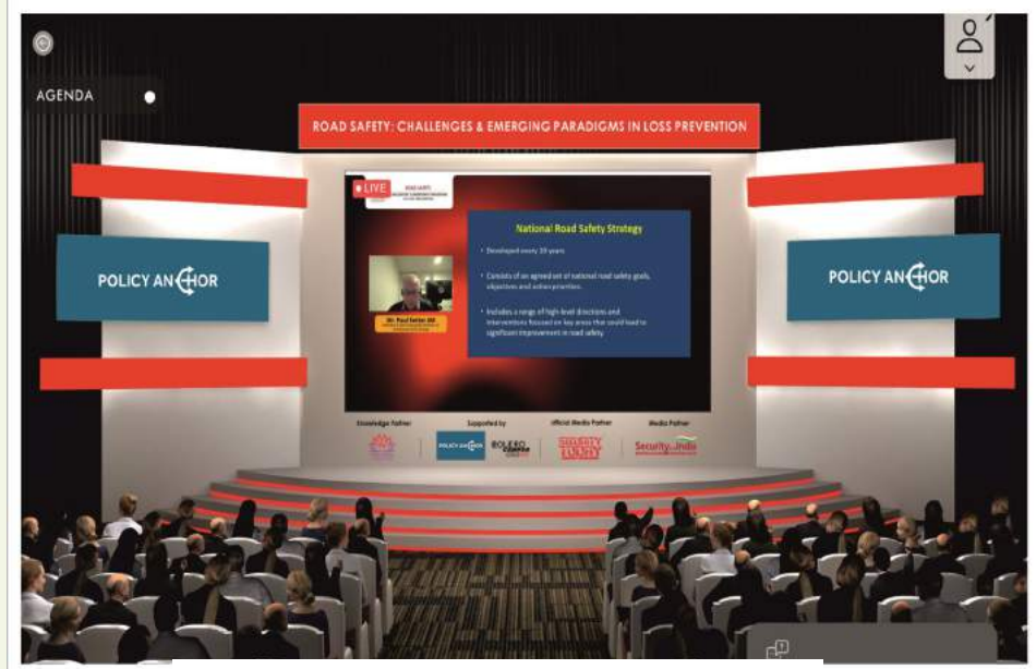
Ambience of the Virtual Auditorium